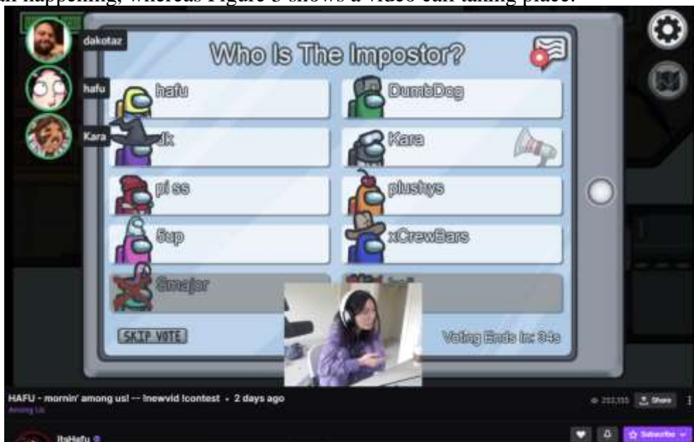
Figure 2. Screenshot of an audio call in a Twitch channel

The second kind of communication technology observed within this platform is presenting an audio or video call. It is mostly done by the streamer when playing with other people, which requires communication, such as a competitive deception game where players can be from all over the globe. From the website's perspective, this communication is hosted and done by a third-party application and is funneled to the stream to be watched or listened to. Viewers essentially observe this communication by being in the channel. Figure 2 shows an audio call happening, whereas Figure 3 shows a video call taking place.