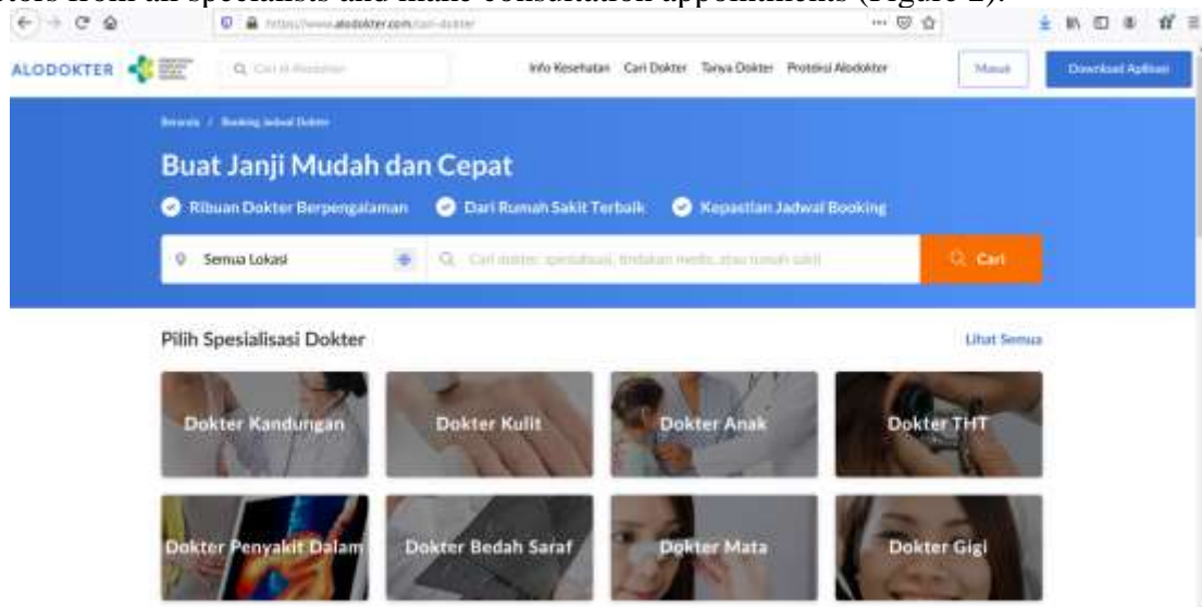
Figure 2. Features of the doctor selection process

Figure 1 shows the home page of the Alodokter.com website. There are several features on the homepage of the website, such as a login for account registration. Then, we can find doctors from all specialists and make consultation appointments (Figure 2).