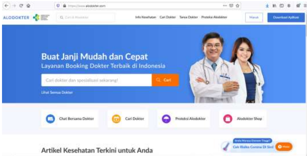
Figure 1. Alodokter's Website

Figure 1 shows the home page of the Alodokter.com website. There are several features on the homepage of the website, such as a login for account registration. Then, we can find doctors from all specialists and make consultation appointments (Figure 2).